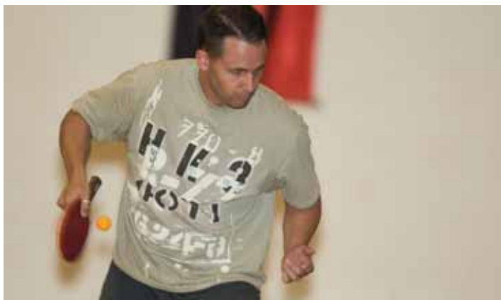
Table Tennis Coordinator

Hosted by the NSW Police Table Tennis Club Inc